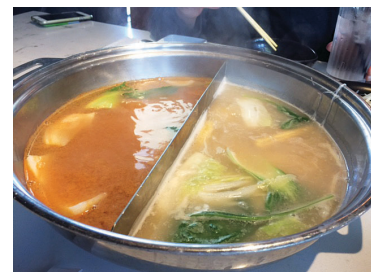
Two Different Broths in 2 Compartments