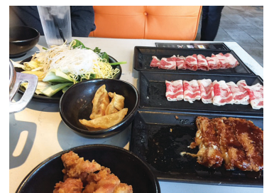
Appetizers, Beef and Vegetables