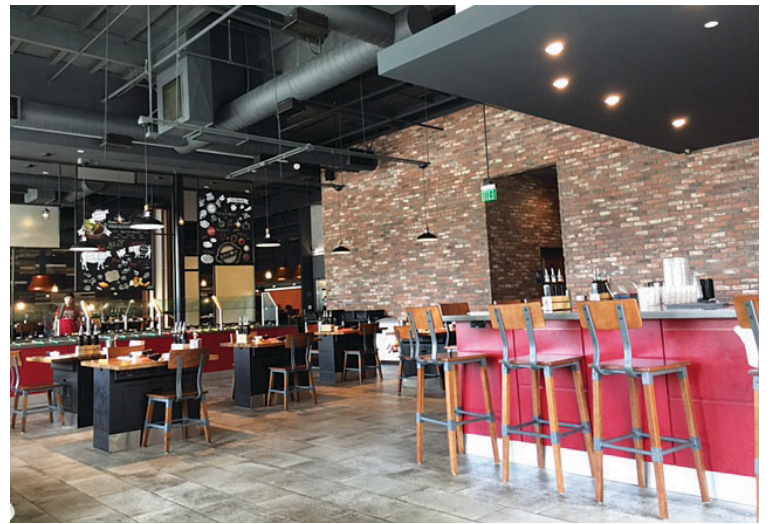
11221 183rd Street, Cerritos, CA 90703 (562) 402-8828

The menu shows all the meats and seafood we can order from, plus all appetizers and rice are included.